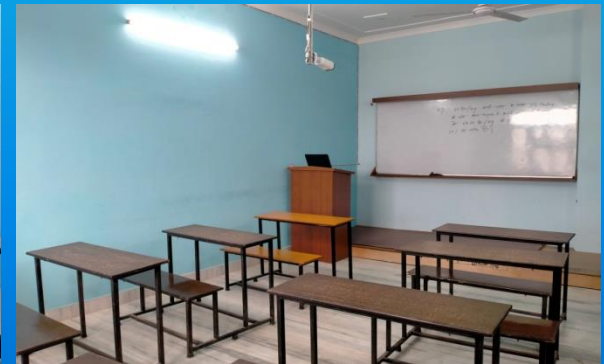
Lecture Hall 3