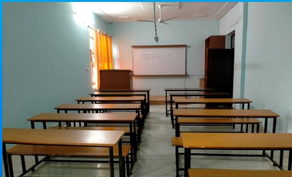
Lecture Hall 1